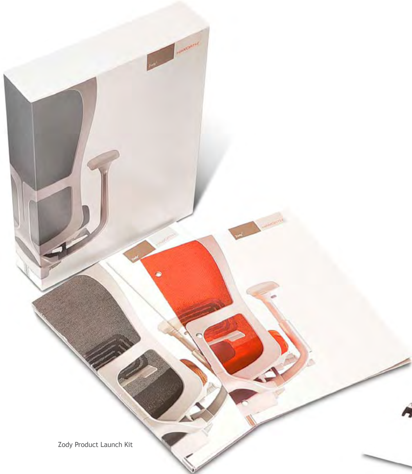
Zody Product Launch Kit