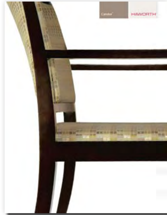
product brochure covers

Haworth is one of the world's largest manufacturers of office furniture with over $1 billion in sales. They have worked with Full Circle over the past six years to design hundreds of marketing pieces including product and corporate literature, event marketing, advertisements and other tools for their sales team. Full Circle has helped Haworth develop and maintain consistency within their brand while elevating the overall effectiveness of each tool.