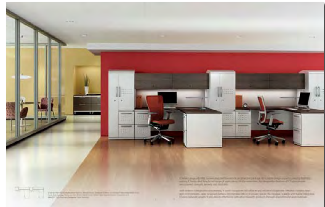
product brochure layout and design