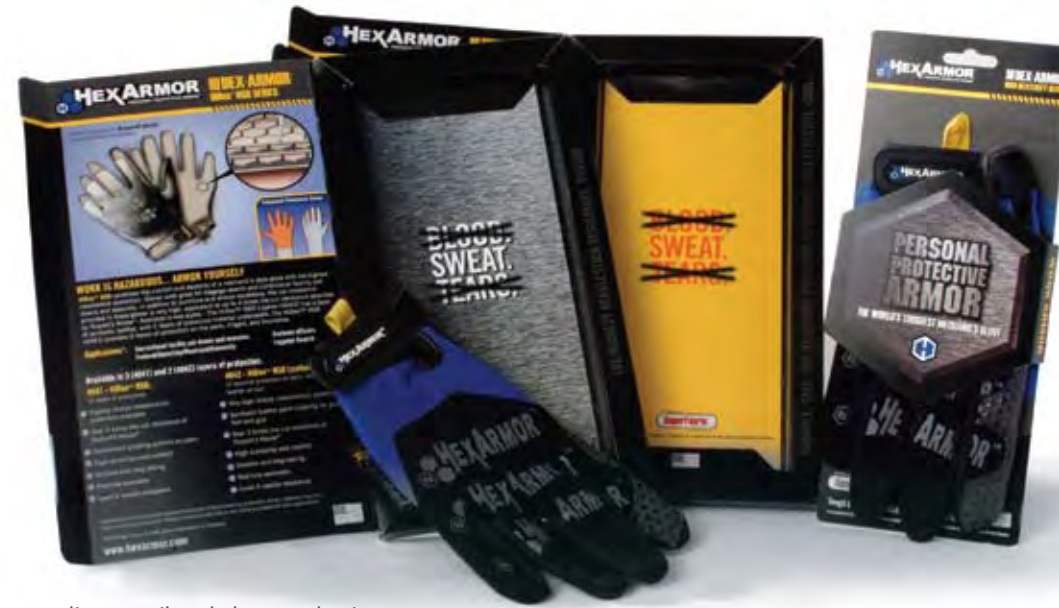
direct mail and glove packaging